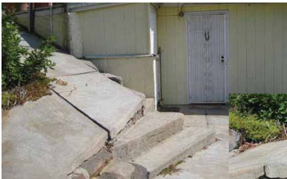
Photo 1: This stairway has high degree of variation in both riser heights and tread depths. If a riser is too high or too low, a person navigating the stairs may find it difficult to maintain safe footing. Treads that are too short force the stair user to either rest only part of a foot on each tread or to twist the foot unnaturally.